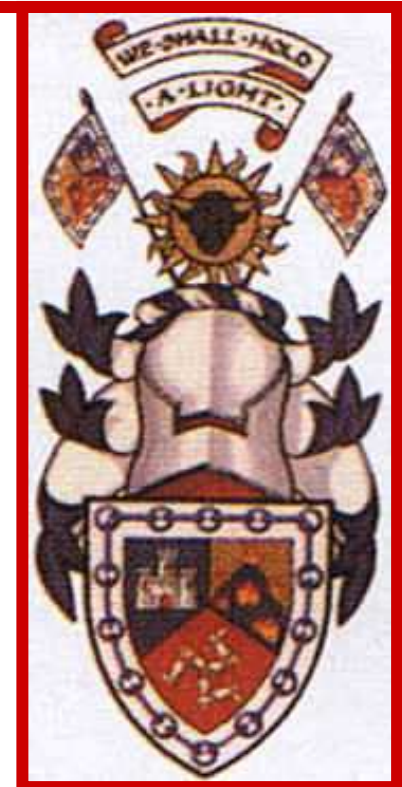
Arms of the ACMS

More information on the ACMS, its objectives, and its projects can be found at http://www.clanmacleod.org .